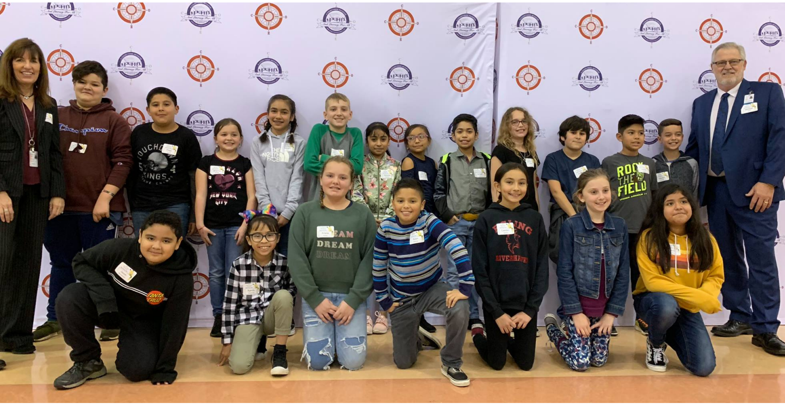
2019's Colusa County Elementary Spelling Competitors

Communicate ● Collaborate ● Operate ● Educate